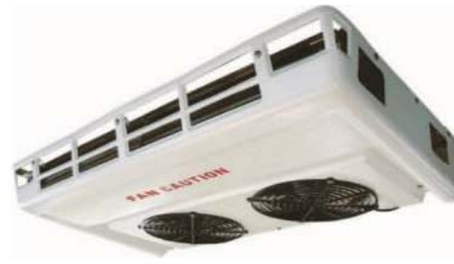
HT-250 II Evaporator