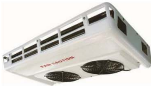
HT-250 II Evaporator