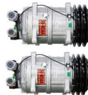
Compressor TM15 x 2ea